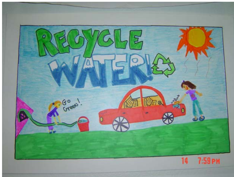
Art Poster by Lauren Tessier

Monte Vista Water District provides retail and wholesale water services to a population of over 134,000 in the communities of Montclair, Chino Hills, and portions of Chino.